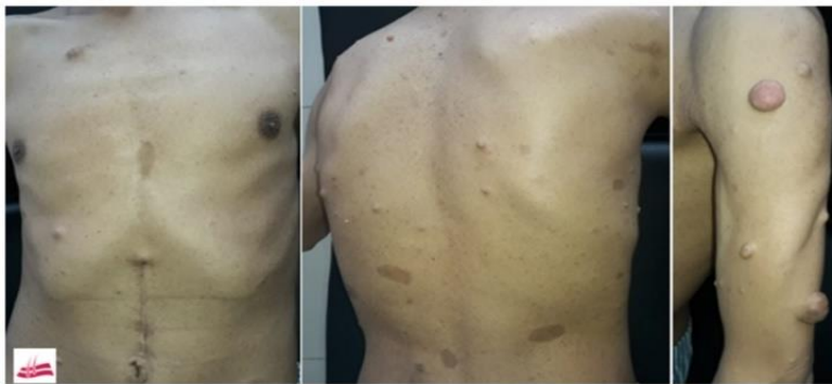
FIG 1. Clinical Signs: Coffee-Milk Spots >15 Mm, Coetaneous Neurofibromas and Generalized Lentiginos.

A cerebral magnetic resonance imaging showed an anomaly of the left thalamic signal corresponding of tumor origin. The patient was referred to the oncology hospital for chemotherapy with IMATINIB with a regular clinical and radiological monitoring.