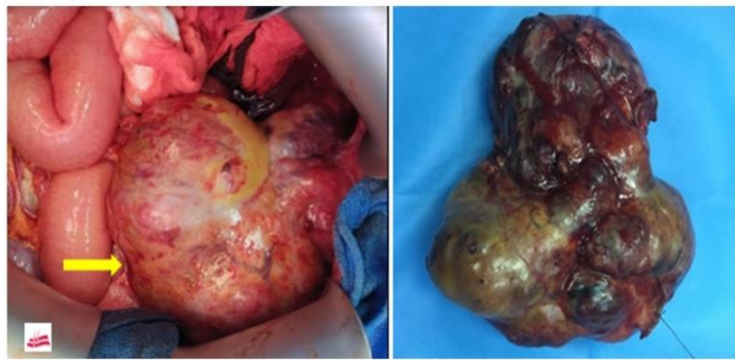
FIG 3. Appearance of the Abdominal Mass Intraoperatively.