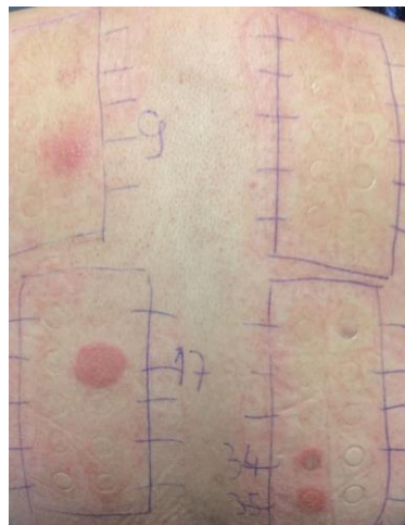
FIG. 2. The results of patch tests: A strong reaction (+++) to PPD, p-aminodiphenylamine, IPPD, disperse orange, nickel.