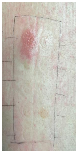
FIG. 3. Strong reaction (+++) p-aminodiphenylamine.