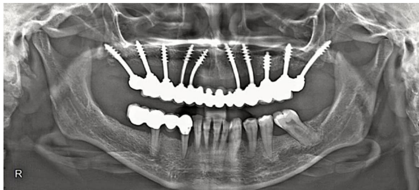
FIG. 8. Orthopantomograph (OPG) of the patient revealing a stable implant engagement with no cortical radiolucency around the threads of the implants on 1-year follow-up of the patient.