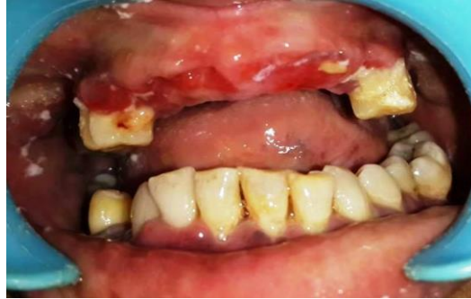
FIG. 1. Clinical picture of the patient with aggressive periodontitis with established Crohn's disease.

Orthopantomograph (OPG) of the patient revealed a severe generalized bone loss indicative of an aggressive periodontitis with few missing teeth in both the arches. Extraction of all the poor prognosis teeth with grade III mobility followed by implant placement was the line of treatment decided. The probability of peri-implant disease and its evidence was discussed with the patient.