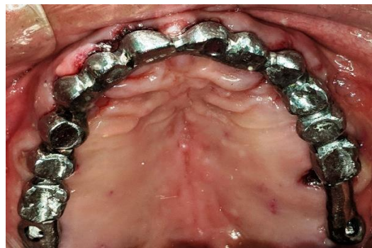
FIG. 5. Trial of the metal framework.