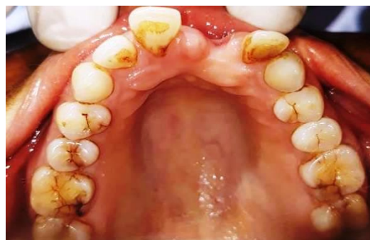
Fig. 1. Pre-operative view of the defect.

A 35-year-old female patient reported seeking treatment for her missing front tooth, her right maxillary central incisor, which she had lost as a result of trauma at the age of 30 years. The patient was in good health with no positive medical history, good oral hygiene maintenance and a strong desire to replace her missing tooth with a permanent fixed prosthesis. Clinical (FIG. 1) and radiographic examination revealed a severe vertical labial bone defect requiring vertical and horizontal bone augmentation. The amount of bone available was inadequate for an implant-supported prosthesis. Hence, vertical and horizontal bone augmentation with guided bone regeneration was planned in the region with simultaneous placement of the endosseous implant. An autograft from the chin was planned taking consent from the patient regarding creation of a second surgical site. Later, for esthetic purpose, soft tissue augmentation was planned for which the patient refused. The complete treatment procedure was explained to the patient and a duly signed consent was obtained.