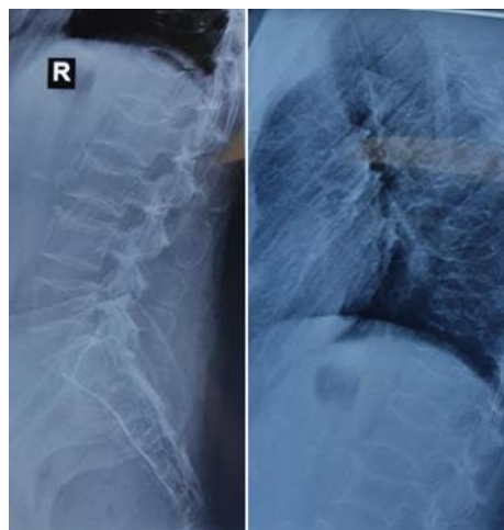
FIG. 1. Radiographs showing wedge compression fractures from T9 through T12.

The physical examination showed her height was 59 inches with a weight of 116 lbs and a body mass index of 23. She was also tender over the lower thoracic region with an apparent kyphosis. There was no associated motor or sensory neurological deficit. A plain radiograph revealed osteopenia with sequential wedge compression fractures of vertebra T9 through T12. FIG. 1 Further investigations to determine a potential secondary cause of osteoporosis included serum calcium, alkaline phosphatase, phosphate, thyroid function, parathyroid hormone, vitamin D, FSH, LH, progesterone and estradiol levels as well as renal and liver function tests which were all normal.