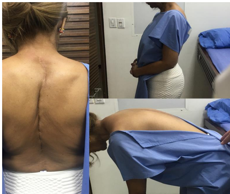
FIG. 4. Healed surgical wound (left). Independent stand up position (upper right). Adequate mobility (lower right).

Our patient showed satisfactory functional outcome (FIG. 4). Radiotherapy has been established as a successful treatment and different protocols have been used in individual cases, to avoid transformation to multiple myeloma, which occurs in 50% of the cases within 5 years [10,11]. Plasmacytoma have a significantly higher 5-year survival rate compared to multiple myeloma, which is 75% vs 32%, respectively [13,14]. Knobel et al. [15] demonstrated that, in solitary tumors less than 5 cm in size, local control was attained with moderate dose radiation at a rate of 91%; and 73% in those >5 cm. Extradural Plasmacytoma causing compressive myelopathy is exceedingly rare, and to the best of our knowledge, only a few cases have been reported in literature [16-22].