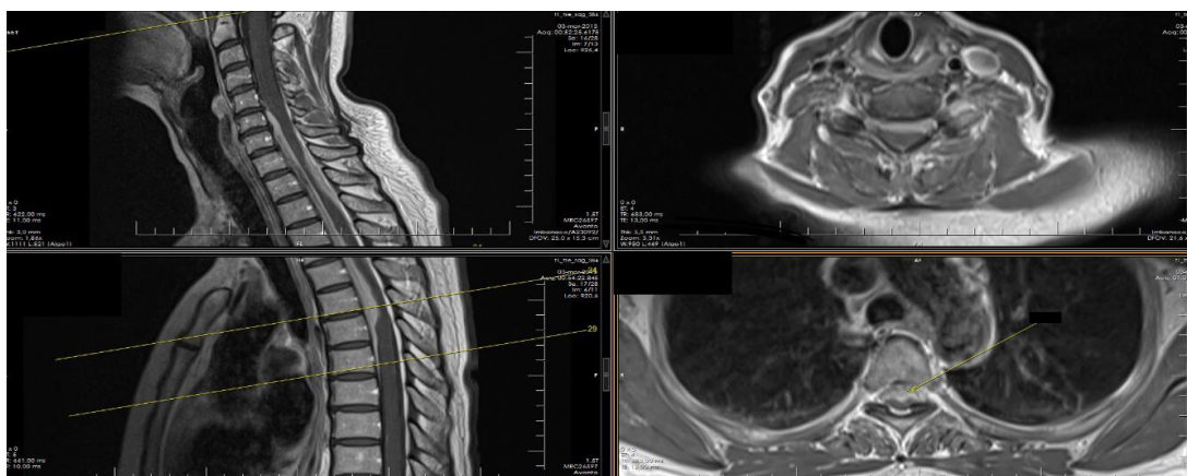
FIG. 2. Initial MRI with Gadolinium contrast medium that enhances extradural mass.